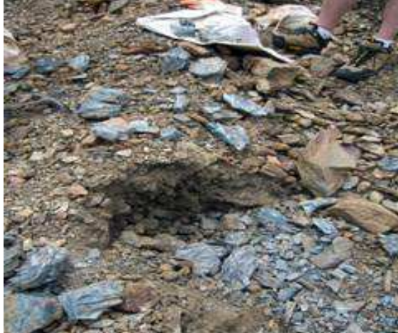
view from the mine.