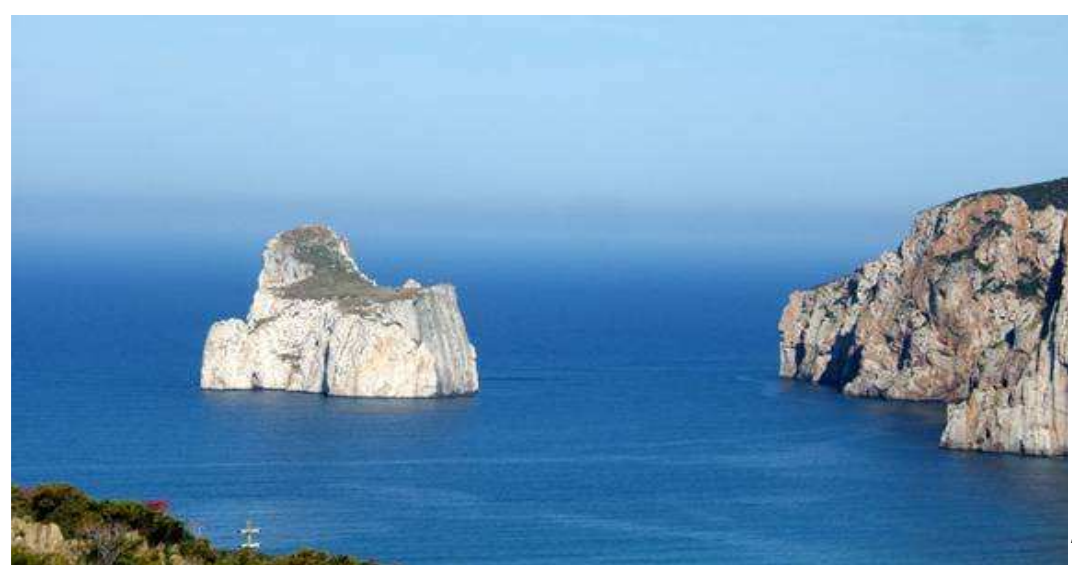
Pan di Zucchero

We did find the lengthy dumps from this famous mine. There was a tremendous amount of material to look at and one day just didn't do it justice. I found both blue and clear hemimorphite , as well as agardite , brochantite , fluorite , philipsburgite , malachite and vesuvianite . The philipsburgite was a particularly excellent sample: tiny blue spheres on blue coated clear crystals. This would be a site well worth visiting again. Because everyone found crystals, it was a good collecting day. We celebrated with a picnic lunch, followed by the Sardinian liqueur, Mirto, courtesy of the Manca Bros.